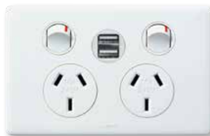
Application example EMUSB2PSAWE + ED777XWE